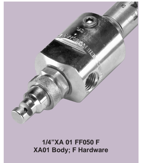
1/4"XA 01 FF050 F XA01 Body; F Hardware