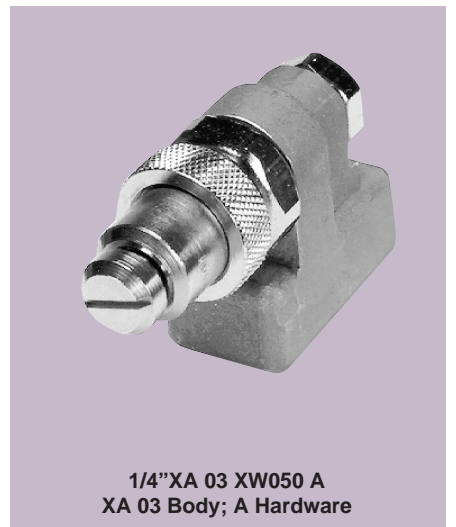
1/4"XA 03 XW050 A XA 03 Body; A Hardware